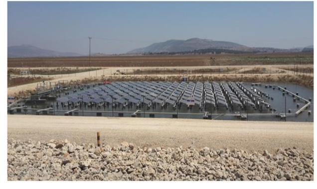
The Solaris Synergy installation on the Eshkol reservoir, Israel

The technology has been proven in an operational plant in the North of Israel belonging to Mekorot the Israeli water utility company and is currently in the process of a large scale installation. Solaris Synergy is one of a very few number of companies worldwide able to offer a commercial floating PV solution, and the only one to do so at a competitive cost with land based installations.