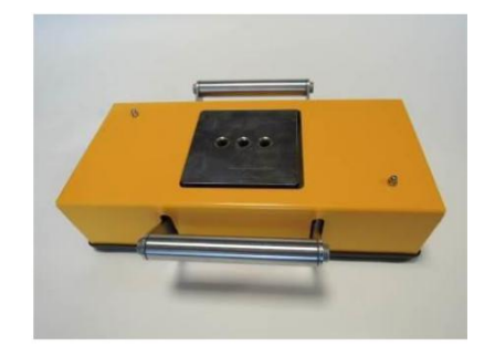
special key with ratchet