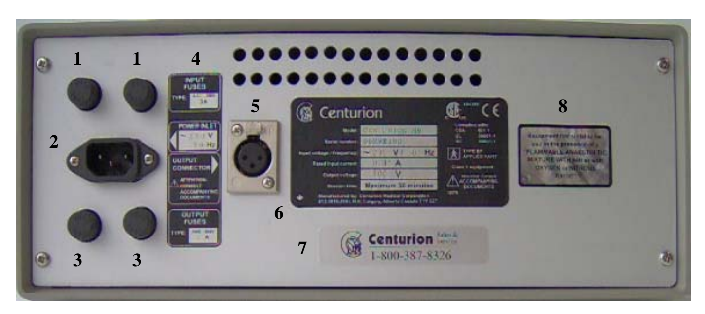
Figure #7: 9PH Rear Panel Features

At the rear of the unit, there are two (2) input and two (2) output fuses (see Figure #7).