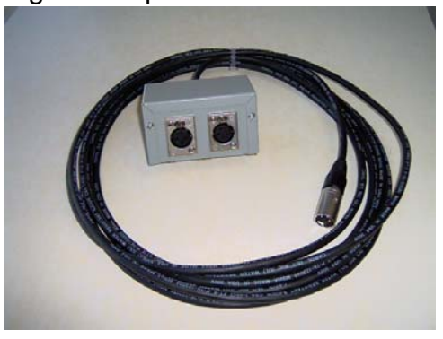
Fig #11 - Splitter Box - #Y601