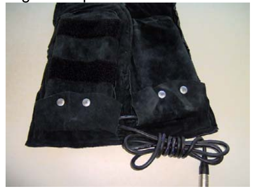
Fig #12 -Spat - #Y602