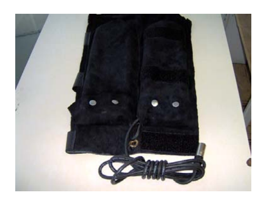
Fig #13 - Hock Boot - #Y603