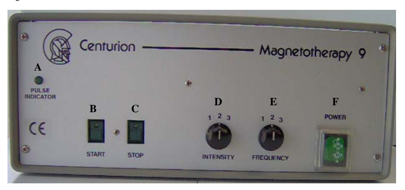
Figure #6: 9PH Front Panel Features

All of the controls to operate the system are located on the front panel of the 9PH unit as per Figure #6: