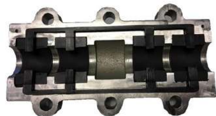
Lubretec Wire Rope Lubricator, Extra Seal Kit IZ-WRLDS01A0+ mm