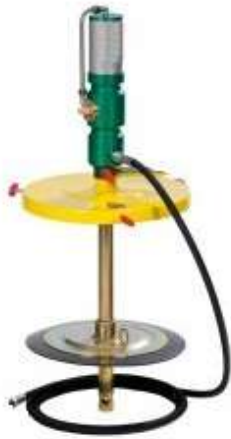
LT-WRLPMP020 LT-WRLPMP050 LT-WRLPMP180