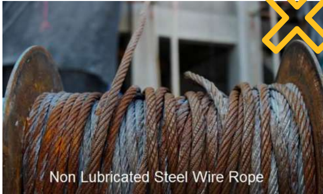
Non Lubricated Steel Wire Rope