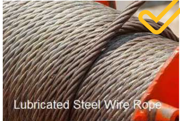
Lubricated Steel Wire Rope