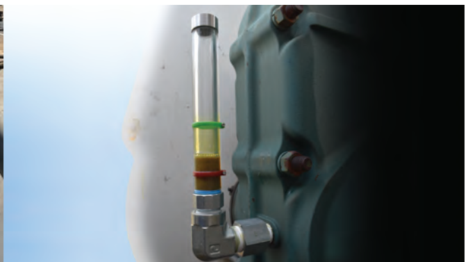
3-Micron Breather Option - Speed Reducer

Available Male Thread Size: NPT 3/8", 1/2", 3/4" and 1" Available Lengths: 3", 6", 9", 12", 15", 18", 24", 36", 48" and 60" (custom lengths are also available)