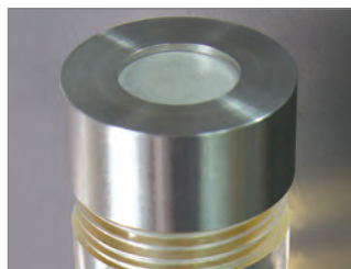
Breather 3-micron BREATHER.COLUMN