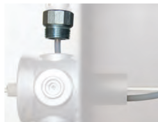
Bypass Tubing Kit BYPASS.COLUMN