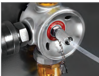
The Hub HUB.XXX