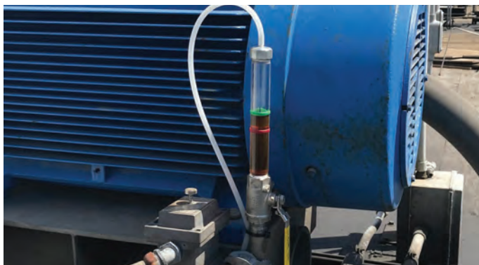
Vent Tube Option - Cooling Tower

The Column is a 3D sight glass designed for monitoring of fluids with greater fluctuations in level. The Column can be installed at the drain port or anywhere below the oil level. Included red and green level rings provide easy monitoring of the level between idle and running conditions. The level rings have a tamper-proof design to prevent accidental adjustments. The top of the Column includes either a 3-micron stainless breather or a vent tube kit for plumbing the air back to the headspace of the oil reservoir. The Column is made of the crystal-clear and chemically resistant Tritan™ material with 1" NPT threads for extra durability and also includes zinc-plated or stainless steel steel thread reducers. The Column works great with Luneta's Hub and Bowl. There is also a bypass tubing kit so the Column can be used in conjunction with a filter cart.