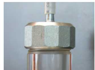
Vent Tube Kit VENT.COLUMN

For more info contact Enluse B.V. - info@enluse.com - www.enluse.com