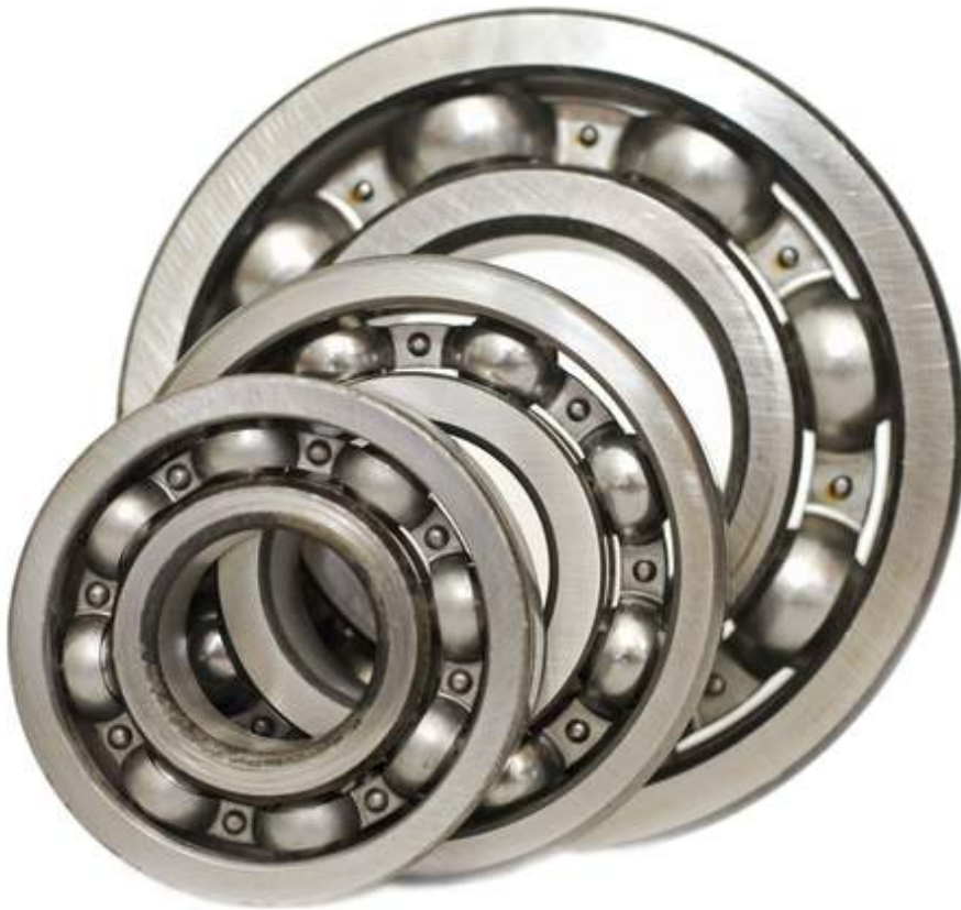
Small and large ball bearings

Using three ball bearings to demonstrate this and to show when an electric gun should be used.