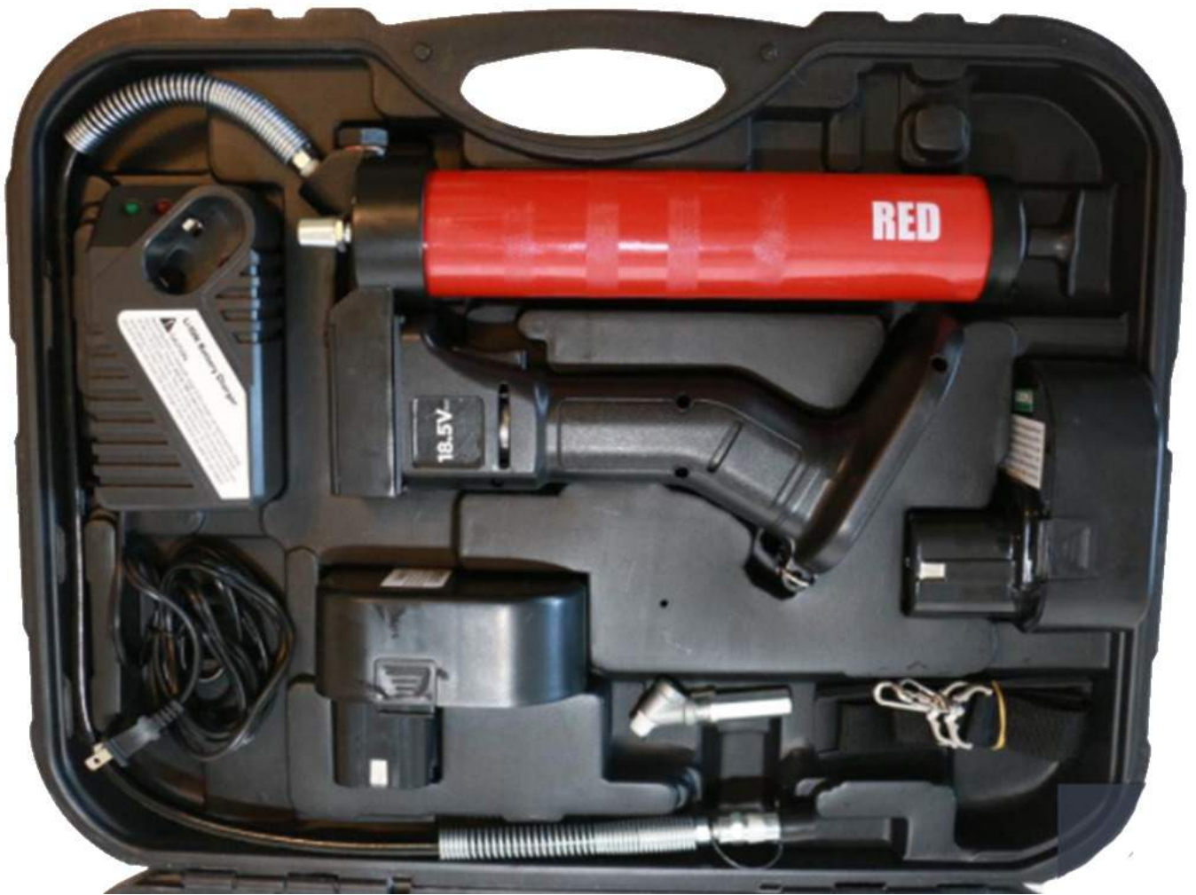
Battery-operated grease gun kit – OilSafe