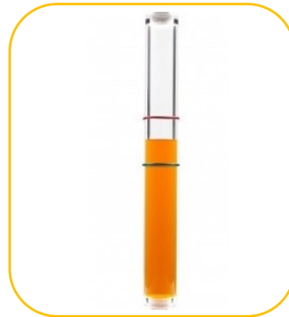
OilSight Glass Level Monitor