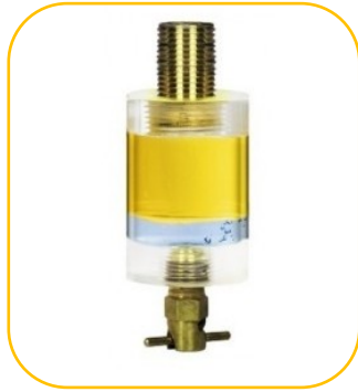
OilSight Glass (vertical)