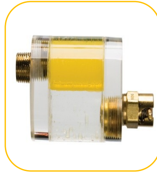
OilSight Glass (horizontal)