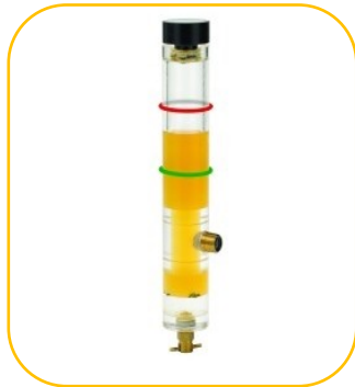
Oil Level Indicator