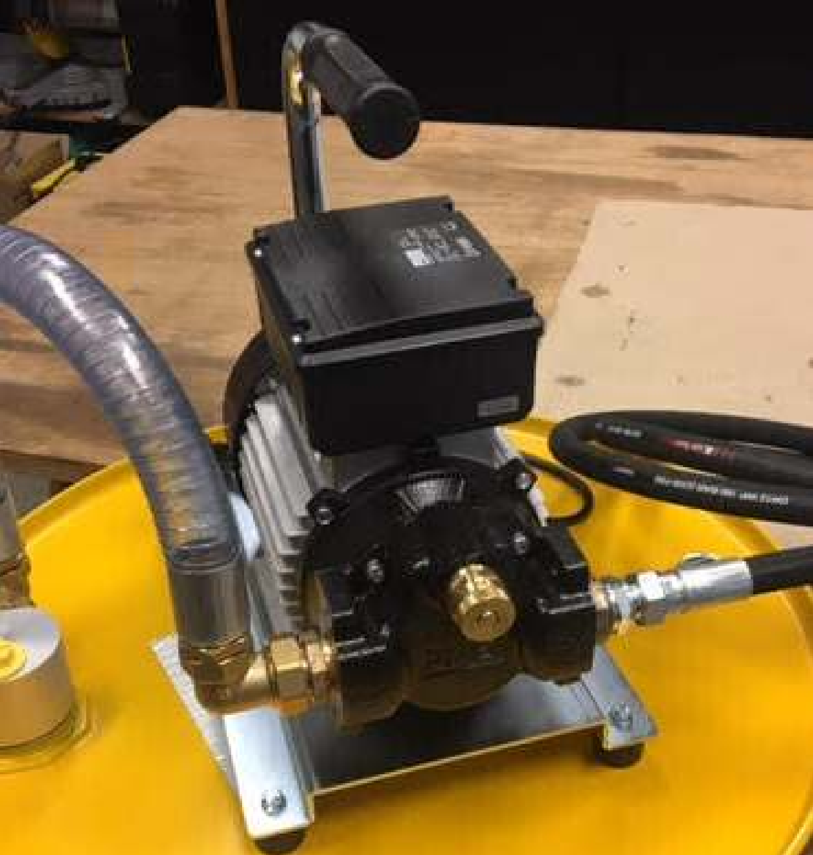
Decolube Drum Transfer Unit