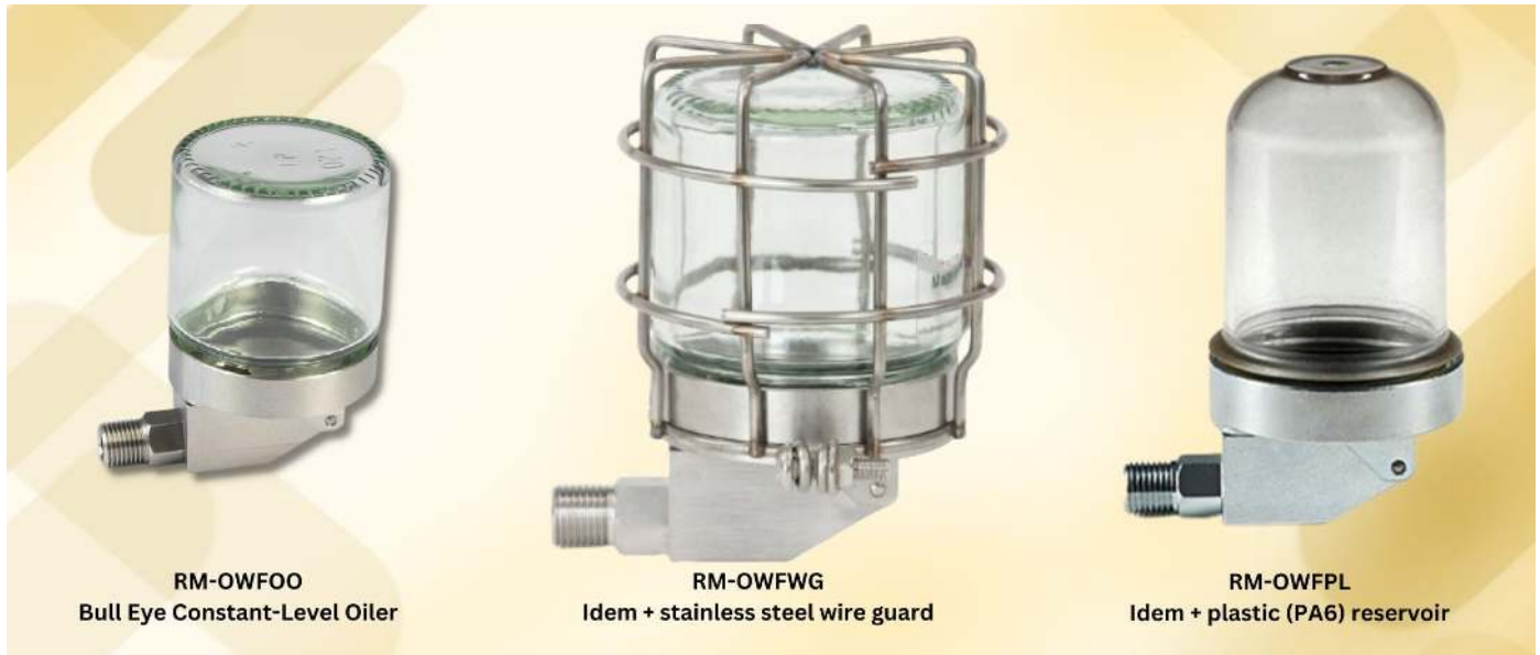
RM-OWFOO Bull Eye Constant-Level Oiler

Explore a snapshot of our extensive assortment of constant-level oilers. While not exhaustive, you can download our brochure below or contact us for more details. Experience our comprehensive offerings designed to maintain consistent lubrication in your machinery.