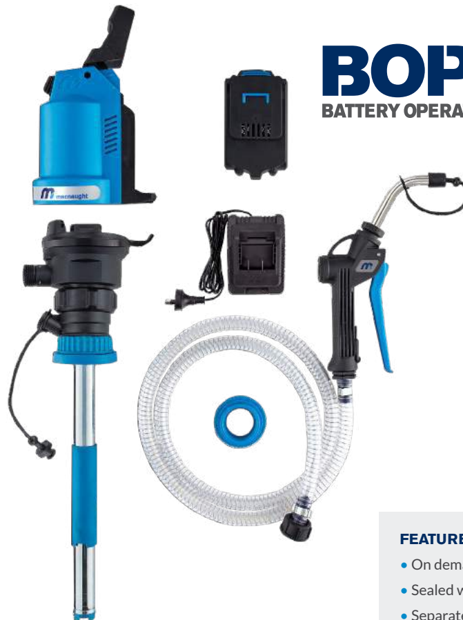
BP20S-OLE (UK: BP20S-OLB)