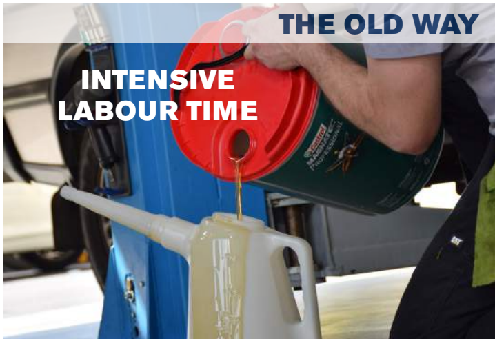
Inefficient workflow and increased manual fatigue.