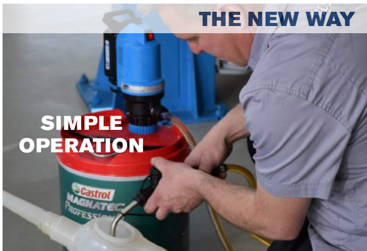
Improved workflow efficiency and reduced fatigue, with a simple flick of a button.