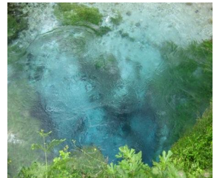
Syri i Kaltër (The Blue Eye)